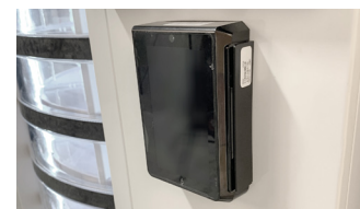
Secured Payment System TPV Moneris