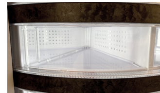
40 to 120 adjustable compartments