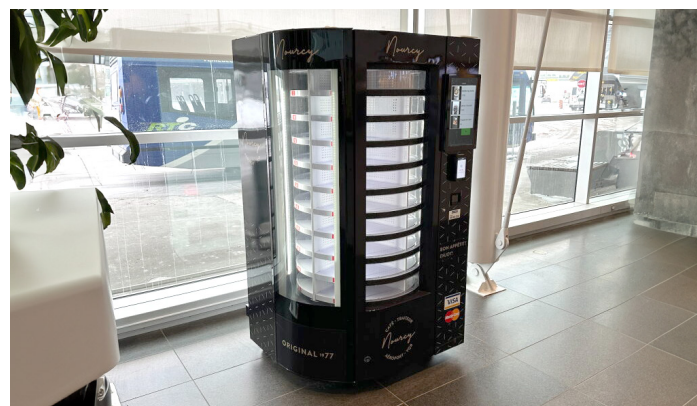
Umac 1 at Quebec City Airport YQB