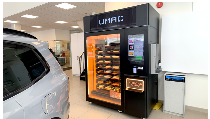
Umac 2 at KIA Ste-Foy - 1600 Rue Cyrille-Duquet, Quebec city