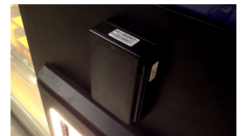
Secured Payment System TPV Moneris