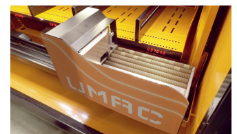
Dish transport trolley to the microwave oven