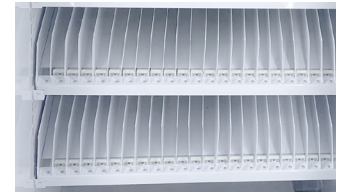
180 compartments to hold all your products