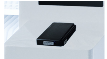
Secured Payment System TPV Moneris