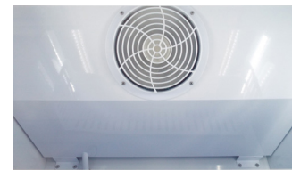
Compartments with a cooling system