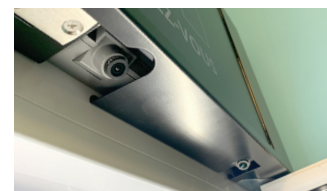
Camera and artificial intelligence control system