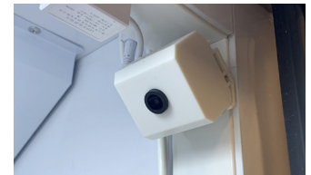
Camera and artificial intelligence control system