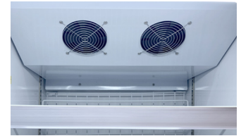
Compartments with a cooling system