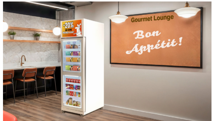
UMAC 3D for the modern workplace